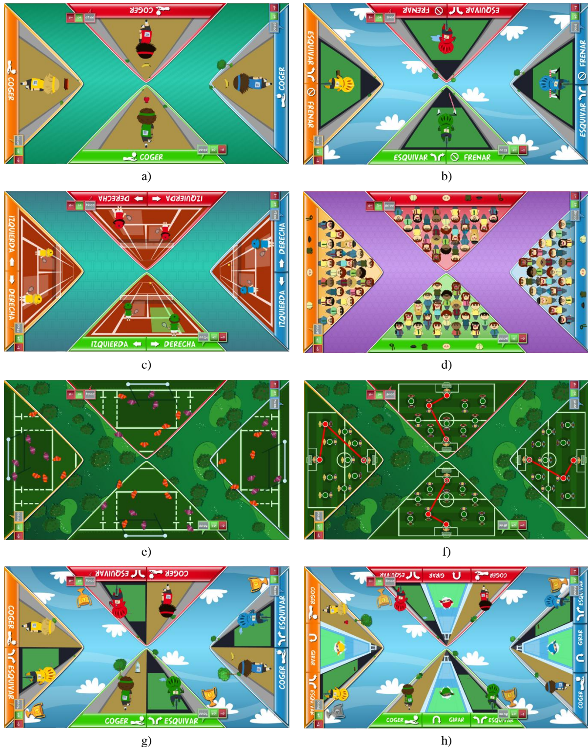
Figure 2. Snapshots of the exercises: a) marathon; b) cycling; c) tennis; d) public; e) football; f) soccer; g) duathlon; and h) triathlon.

The system included eight exercises that focused on the same attentional skills that were involved in the paper and pencil tasks, mainly related to attention, and recreated different Olympic events and scenarios (Table 1, appended). Besides the cognitive demand of each exercise, the timing of the required actions was important. As a proof, in marathon and public, participants had to grab an item or to identify a character as fast as possible, respectively. In contrast, all the actions in cycling, tennis, duathlon, and triathlon had to be done at the precise moment, which was highlighted in the environment with changing colors (for instance, in cycling, when an obstacle entered in the area of interaction of the character, the area turned into green, thus indicating that the user should press the button to avoid the obstacles). This way, not only reaction was trained but also impulsiveness.